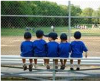
KEEPING KIDS SAFE! Learn More