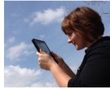
BOOST MICRO LEARNING Learn More