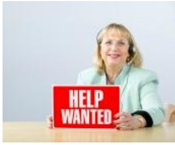
HUMAN CAPITAL Learn More